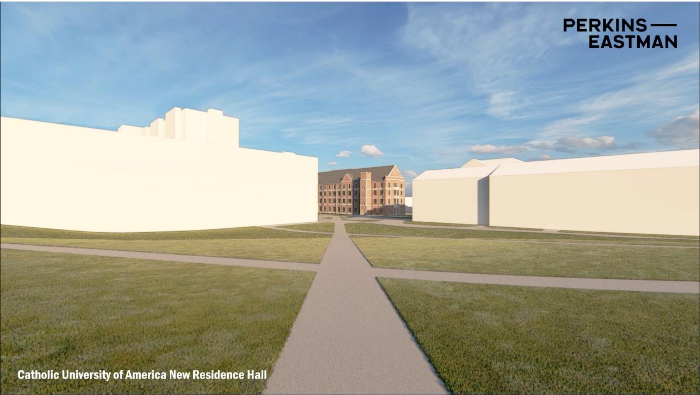
Catholic University of America New Residence Hall